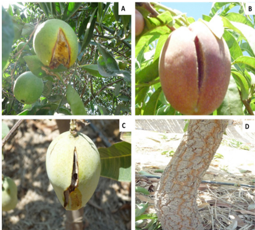
Fig. 2. Cracked fruits is a common phenomenon, which may as a result of errors in agricultural operations. (A) orange fruit (B) peach fruit (C) mango fruit comparing with (D) cracked stem mango.