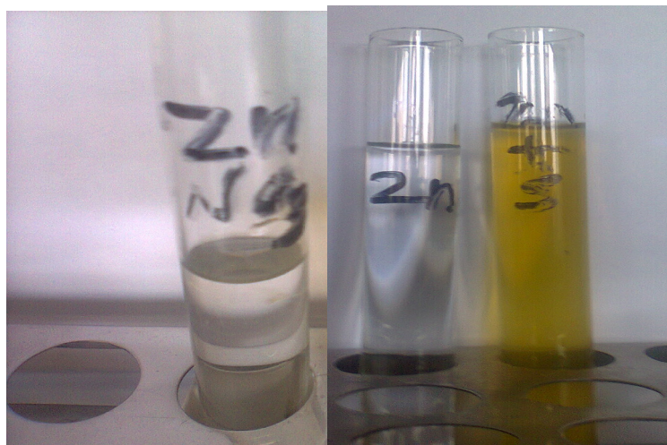
Fig. 3. Dark stable yellow with reaction mixture of Morus nigra ,T5 (Zn+Ex) in the left, Grevillea robusta (Zn+S) in the right means confirmed of Zn NPS and Zn (1mM of Zn NO 3 ) in the middle .

The bio reducing of aqueous zinc ions by M.nigra and G.robusta plants had been demonstrated and could be anew and good source for synthesis of ZnO NPs eco-friendly method.